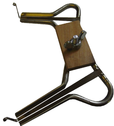
Starter set D-G with detachable screw connection

In order to change the key within a song, the Jew's Harp must also be changed. For this purpose, they can be connected with each other.