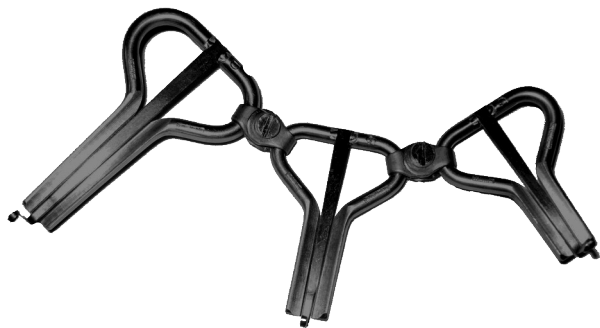
Professional set D-G-C with permanently mounted screw connector

Jew's Harps are preferably compiled in so-called "folk music triads" such as: